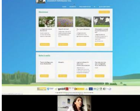
Figure 6: Meeting with Jane Goodall at Biofach Fair 2020, Germany (left); Expert talk on Sustainable Agriculture, Spain (mid); Online Presentation of the Biodiversity Performance Tool (right).