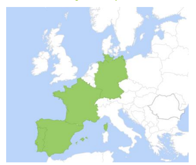
Figure 1: Spain, France, Portugal and Germany were target countries of the EU LIFE Food & Biodiversity Project. The project partners transferred experiences and results at EU level and worldwide.

The agricultural sector – including food processors and food retailers - has a huge impact on biodiversity. With the support of food standards and through effective and goal-oriented sourcing requirements, the food sector can make a significant contribution to curbing biodiversity loss.