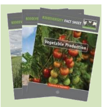
Figure 5: Fact Sheets published in the project