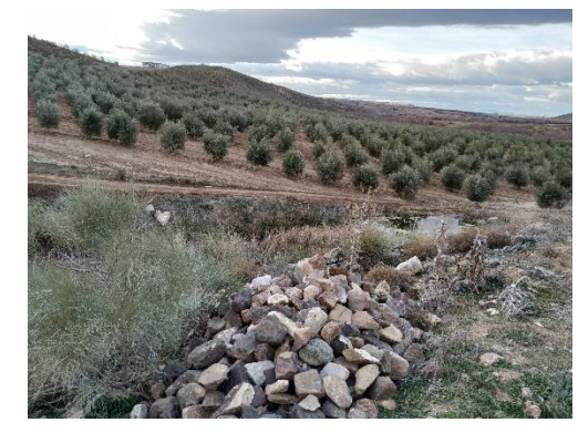
Figure 4: Stone piles on olive pilot farm

a total area of more than 300 ha. Measures like green covers, floral bands, organic fertilization and the establishment of ecological structures like watering places for fauna, stone piles and root balls of old almond trees have been applied. The project has also focused on enhancing biodiversity in vegetable production. As a result, 15 tomato farms with a total of 300 ha of intensive tomato production have been managed in a more biodiversity friendly way, using cover crops and bat refuges for integrated pest control and restoration of semi natural habitats. In the vegetables sector, a melons pilot farm has participated with about 75 ha of crops and improved their irrigation water efficiency and implemented flowering strips for pollinators.