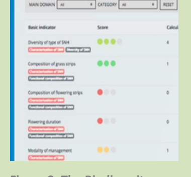
Figure 2: The Biodiversity Performance Tool