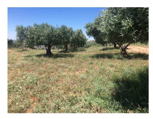
Figure 3: Cereals sown in wide rows in order to give wild herbs space and light to germinate (left). New cork oak trees ( Quercus suber ) were strategically planted to help regenerate Montado areas (the Montado is an agroforestry system rich in biodiversity, mid). Green Cover in olive Crops (right).