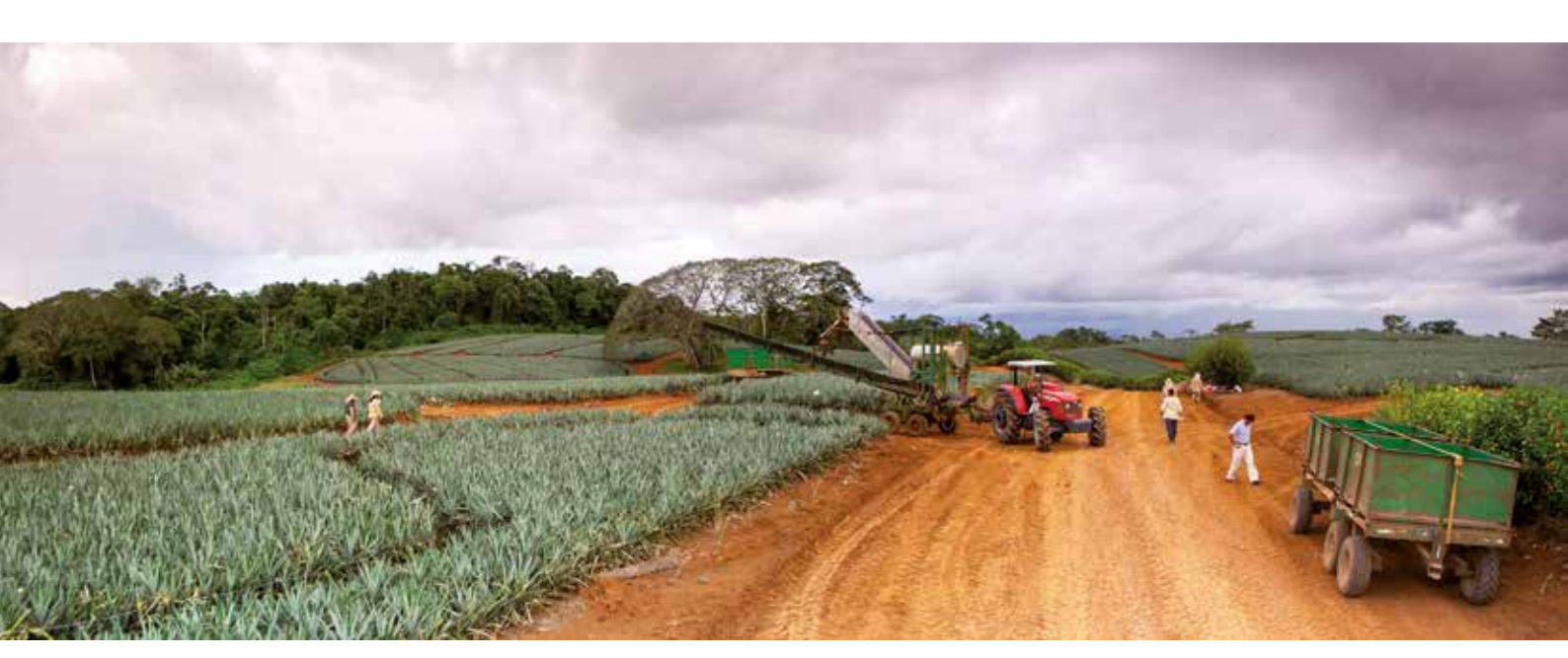
5 Rainforest Alliance Impact Report 2018, Chapter 5 Conserving Natural Ecosystems: https://www.rainforest-alliance.org/sites/default/files/2018-03/RA Impacts 2018.pdf