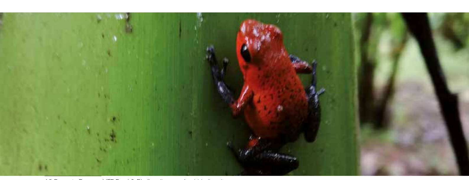
12 Proyecto Europeo LIFE Food & Biodiversity: www.food-biodiversity.eu

This is a "living document", which means that we will be reviewing the recommendations in a few years, adding new knowledge and methods that will contribute to the protection of biodiversity.