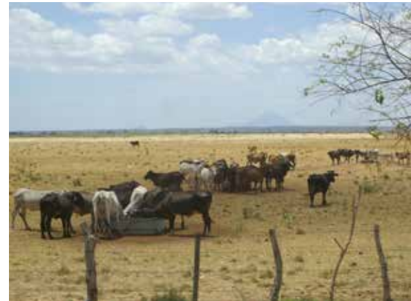
The transformation of rainforests into pastures leads to the destruction of the ecosystem and the degradation of soils.