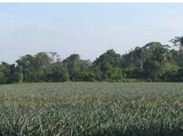
Lack of policy coherence and incentives for forest restoration can lead to the promotion of monoculture plantations.