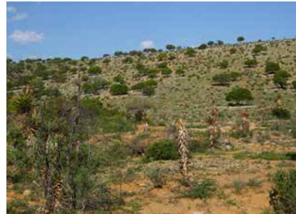
Heavily degraded areas require innovative financing ideas and investors with longer investment periods of at least ten years, as in the Baviaans-kloof in South Africa.

Investors, such as institutional investors or investment funds with high investment volumes, prefer to invest their capital in a small number of larger projects in order to keep administrative expenses and costs low. This poses major challenges for project developers, especially when smallholder farmers are involved and species-rich systems are established in the landscape. It is difficult to generate a high return with smallholder structures and species-rich systems in long-term projects. The reasons are the high coordination effort involved, the necessity of capacity building and the required differentiated knowledge of sustainable cultivation methods. Often the smallholder families themselves have an income below the subsistence minimum. Forming part of projects to develop forest and agroforestry systems could improve their livelihood. However, in this kind of projects high incomes for farmers and attractive returns for investors are rarely generated.