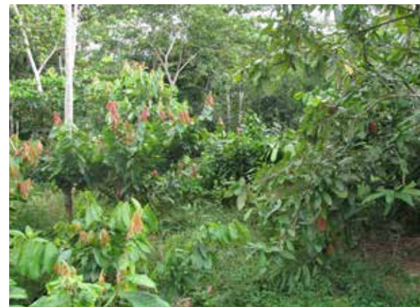
Agroforestry systems create new sources of income and reduce pressure on the rainforest in the Madre de Dios region of Peru.