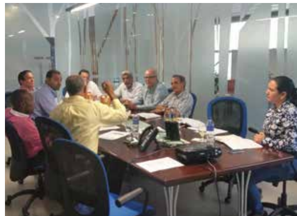
FLR actors and investors come together at different levels (landscape, regional and national).

To ensure that FLR Initiatives for the restoration of forests and landscapes at an international level do not risk becoming unreliable or meaningless, it is important to develop internationally recognised minimum requirements or exclusion criteria for the selection of promising FLR measures. These requirements and criteria should include the rights of local communities and indigenous peoples, consultation and participation processes, and environmental aspects, particularly in relation to natural forests and biodiversity, as is already the case in other international safeguards .