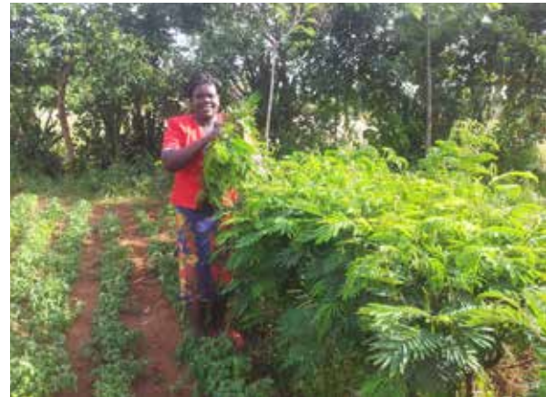
Implementation of SDGs in practice: In the Livelihoods Fund case study in Kenya, trees were planted to store carbon and fodder trees were cultivated to reduce open grazing areas.

Measuring progress in the restoration of forests and landscapes is often based on voluntary feedback from the respective countries and other stakeholders. There is often a lack of technical quality assurance in relation to the protection of biodiversity and the involvement of the local population. There is also a risk that large-scale monoculture plantations will rank among the restoration initiatives. Here, criteria and standards can provide initial assistance to ensure the conservation of biodiversity and ecosystem services as well as the involvement of the local population in forest landscape restoration.