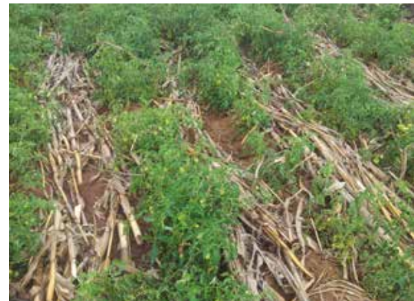
Simple agricultural practices such as mulching do not require investment and improve soil quality and food production in the Mount Elgon project in Kenya.