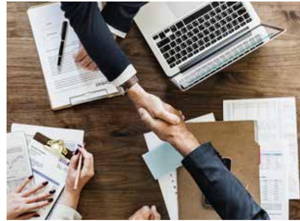
Cooperation between stakeholders from politics, the private sector, the financial sector, science and civil society is crucial for achieving international agreements.

In this study, OroVerde – Tropical Forest Foundation and the Global Nature Fund analysed various initiatives for the restoration of forests and landscapes using private funding and identified important success factors of the individual measures.