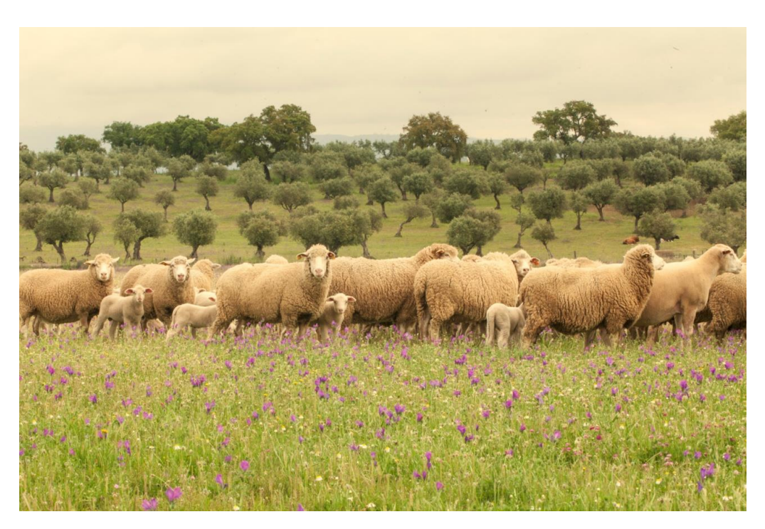
Figure 1 – Sheep ( Ovis aries ) is among the most popular species reared worldwide as livestock. The global standing population for sheep and goats ( Capra aegagrus hircus ) is estimated at 1.87 billion individuals (Robinson et al. 2014).