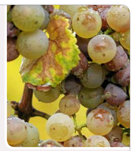
Botrytis cinerea on grapes

Integrated Pest Management – Plant protection is based on several principles in integrated pest management (IPM). Pests, diseases and weeds are kept below a defined threshold with gentle methods and the necessary control measures are coordinated. The natural factors that can limit the pathogens are included in such a regulatory system (e.g. beneficials, susceptibility of the varieties, weather). Every farmer must be able to decide on the necessary measures on the basis of his own checks although guidelines with defined thresholds exist. Therefore, he should improve his knowledge