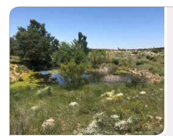
Water body nearby olive crops.