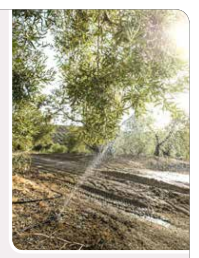
Broken irrigation pipe of olive trees

In terms of irrigation, two approaches can be distinguished. Some olive groves and vineyards are grown in such restrictive conditions that bad years (higher temperatures and less rainfall than average) can entail the complete loss of production. If this happens frequently over a period of time, the activity of these farms is no longer profitable and they are progressively abandoned. However, these extensive farms assume an interesting contribution for landscape diversification, biodiversity habitats, and act as highly efficient and cost-effective firebreaks. Regulated deficit irrigation or controlled irrigation is, in this case, a technique that allows