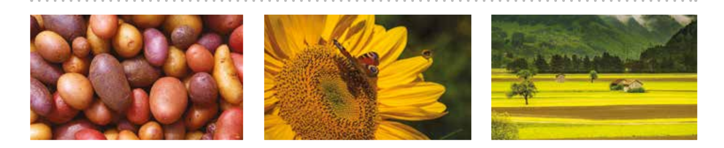
Biodiversity is defined as the diversity within species (genetic diversity), between species and of ecosystems.

Conservation and the sustainable use of biodiversity is an environmental issue and, at the same time, a key requirement for nutrition, production processes, ecosystem services and the overall good quality of life for mankind.