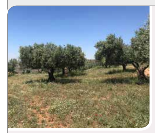
Green cover in olive crops.

In general, soil work and treatments negatively affect biodiversity, as the natural processes described above are interrupted. Oxygen, ultraviolet radiation and heat will come in contact with the soil, particularly after ploughing the resulting furrows and this will lead to severe edge effects for life in the soil. Humification processes, which occur under the exclusion of oxygen, will be hindered; the natural soil pore system is disrupted. Each treatment affects biological diversity within the soil and the fauna and flora above the ground to a different extent and is fatal for many species. Other aspects that limit organic matter formation (low inputs of organic substances, direct or indirect destruction of biomass, direct or indirect destruction of soil organisms, compaction created by excessive machinery used, etc.) are also net contributors to soil degradation.