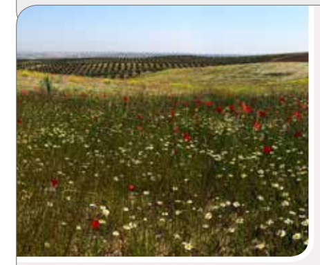
Long flowering period ecological infrastructure.

Herbicides – Wild flowers form the basis of food chains in cultural landscapes. Consequently, if this basis is absent in crops and disturbed in adjacent areas, there will be less food for arthropods and any birdlife depending on that. Many species are almost extinct. Herbicides, working either as contact or systematic toxin, which is taken up by any plant part and transported within the plant, are highly effective in combating weeds. Glyphosate is an example for a total herbicide working as contact toxin. 0.1 ml/m<sup>2</sup> of active matter leads to the desired effect. Herbicides are mostly applied to combat already established weeds on the field, but some products are also used to seal the ground and to prevent the appearance of unwanted weeds. However, these pre-emergence herbicides can mostly be substituted by mechanical weeding techniques.