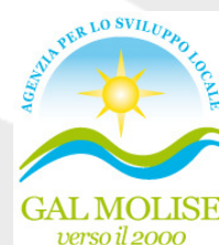
GAL MOLISE VERSO IL 2000 (ITALY)