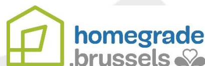
HOMEGRADE BRUSSELS (BELGIUM)