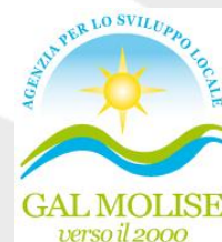
GAL MOLISE VERSO IL 2000 (ITALY)