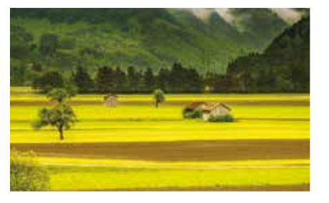
Biodiversity is defined as the diversity within species (genetic diversity) between species and of ecosystems.