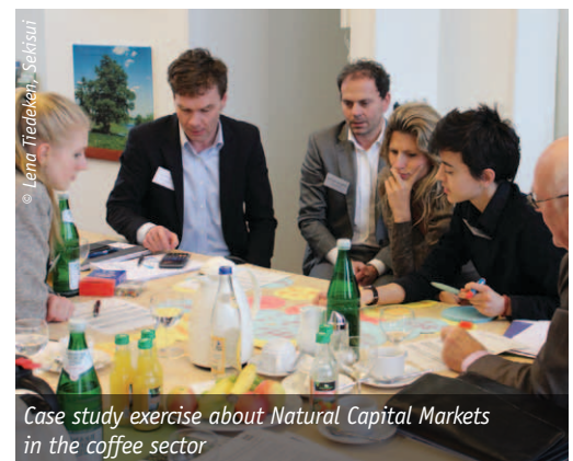
Case study exercise about Natural Capital Markets in the coffee sector