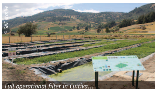
Full operational filter in Cuítiva...