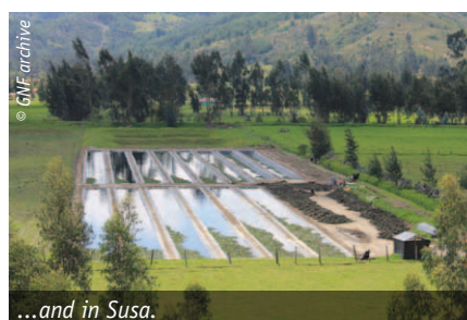
...and in Susa.