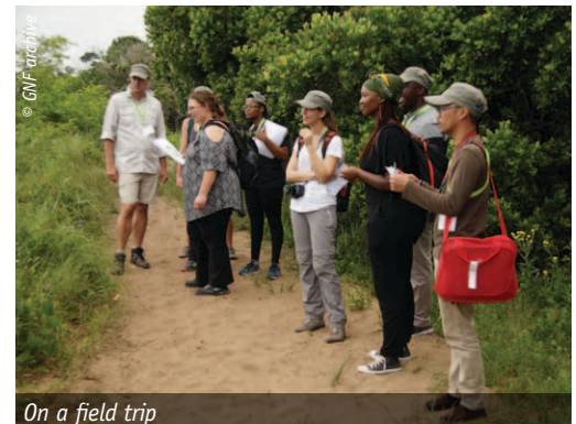
On a field trip