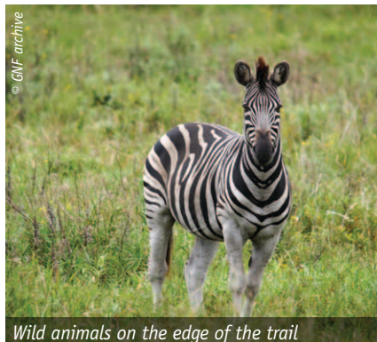
Wild animals on the edge of the trail