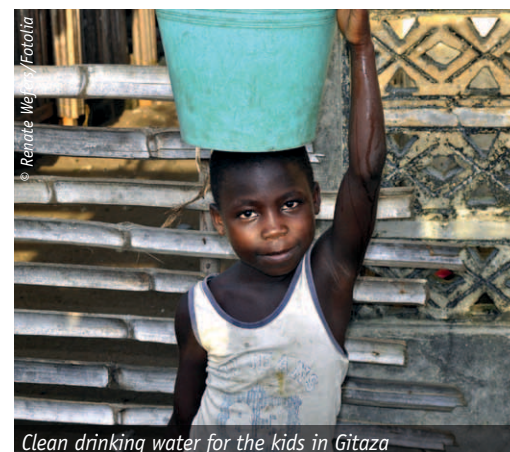
Clean drinking water for the kids in Gitaza

We want to provide clean drinking water to 800 households as well as to 2,800 pupils and a health care center. This will be realized by water treatment plants and an effective infrastructure in the community of Gitaza. Educational measures