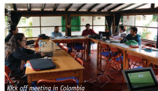
Kick off meeting in Colombia