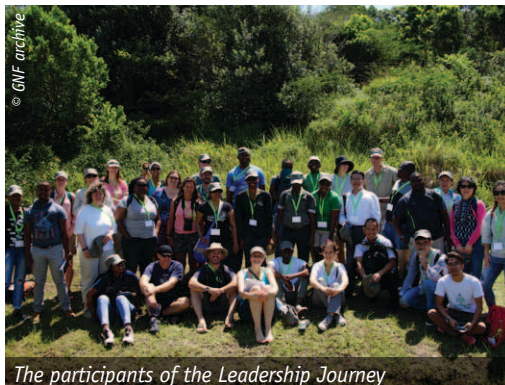
The participants of the Leadership Journey