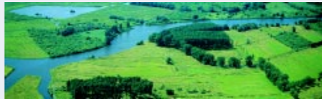
Milicz Ponds, Poland

13 Monks in the middle ages made the bird paradise of the Milicz Ponds in Poland.