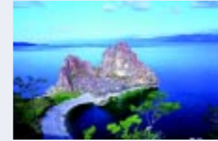
Lake Baikal, Russia

20 Lake Baikal , the „pearl of Siberia“, is the deepest lake of the world and home of the rare Baikal seal.