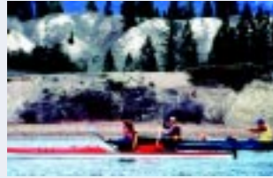
Columbia River Wetlands, Canada

1 The wilderness of the Columbia River Wetlands , Canada, is home to 100.000 mammals such as the Grizzly Bear.