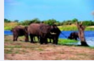
St. Lucia Wetland Park, South Africa

16 Eco-tourism creates jobs in the Greater St. Lucia Wetland Park , South Africa's oldest nature reserve.