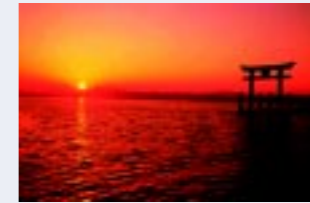
Lake Biwa, Japan

22 Every year, 24 million tourists visit Lake Biwa , Japan's largest lake.