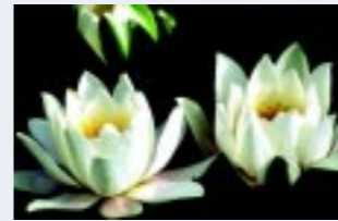
Lake Uluabat, Turkey

17 No other lake in Turkey is covered with as many water lilies as Lake Uluabat .