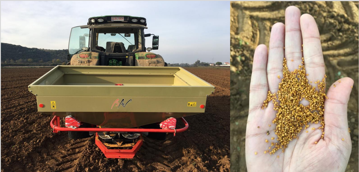
First year of winter soil cover in a processing tomato farm (month of December).