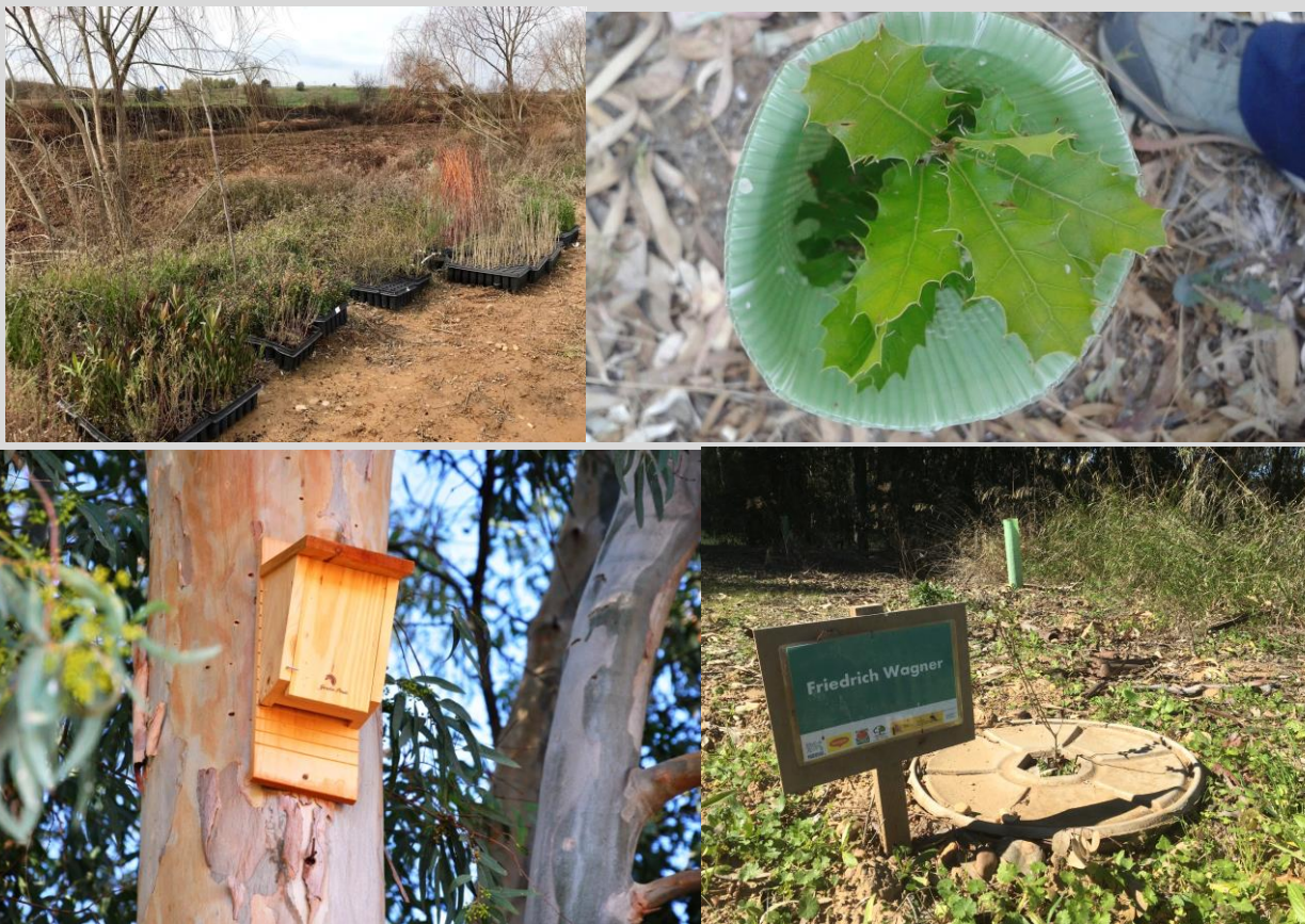
Landscape actions in Perales farm.

Semi-natural habitats and specific Landscape elements can host a high diversity of animals and plants, being, therefore, important to promote biodiversity. Because they provide refuge and food for a variety of organisms, a well-designed planning of semi-natural habitats and landscape elements can mitigate the impacts of agricultural activities on biodiversity, but also support agricultural production through ecosystem services. Examples of semi-natural habitat range from large ecosystem patches, such as scrubland, permanent grasslands, or fallow land, to vegetated banks associated with stone walls or more specific landscape elements such as hedges, buffer stripes, fallow land and flower strips; other examples include single trees (living and dead) in cropland, and reforested areas; there can also be semi-natural habitats associated with water elements, like water plots (streams, ditches, ponds) or water margins (riparian galleries). More information on Landscape elements and