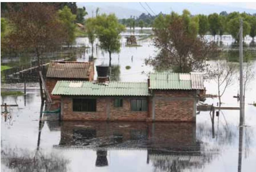
An extreme rise in water level causes new conflicts at Lake Fúquene.

Autónoma Ambiental Regional (CAR) is under pressure and must justify its former attitude. There is hope that the government will finally reorganize the partly corrupt and ineffective institution. Due to the difficult socio-economic and ecological situation, the local GNF partner Fundación Humedales has decided to postpone the conference to 25 July 2011. Perhaps it will then be possible to implement the right measures to save this last lake in the high plain of the Eastern Andean Cordilleras, and its unique wetlands.